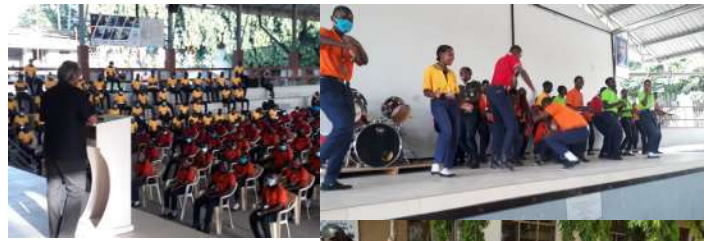
The school Assembly